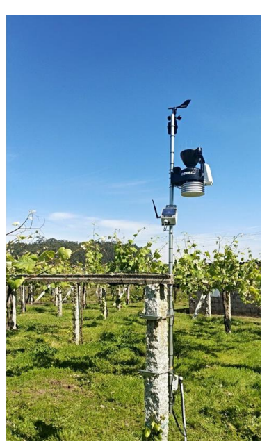
Figure 2. Equipment installed in the vineyards under study within VITICAST project located in the Appellations of Origin (from left to right): Ribera del Duero, Valdeorras and Rías Baixas.

Also, the following results will be obtained in order to evaluate the benefits of the implementation of the prediction and warning tools in the studied Appellations of Origin: